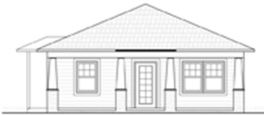
Alternate Elevation # 2